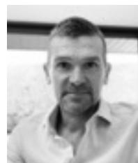
CARL MIDDLETON, VP ON TRADE